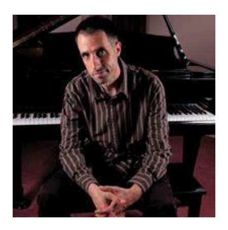
Refreshments Beverages At a lovely private home in the "Sanctuary" in Palm Coast.

Saturday, December 7<sup>th,</sup> 3 pm – 5 pm $20 per person