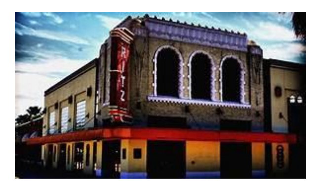
Friday, Dec. 13th 7:30pm