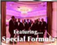
Featuring... Special Formula